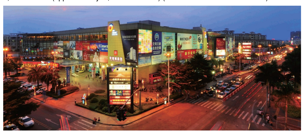
Night view of Shiqi Metro Mall

Singapore, June 16, 2017 – Dasin Retail Trust Management Pte. Ltd., the Trustee- Manager of Dasin Retail Trust, is pleased to announce that pursuant to the Shiqi Framework Agreement as disclosed in the prospectus of Dasin Retail Trust dated 13 January 2017, Dasin Retail Trust (through its wholly-owned subsidiary, Singapore Dasin Commercial Holdings Pte. Ltd.) has entered into a sale and purchase agreement to acquire Shiqi Metro Mall and Shiqi Rental Management Company (the " Proposed Acquisition ") for a Purchase Consideration of RMB 1,224.0 million (approximately $$248.2 million (i)) (the " Purchase Consideration ").